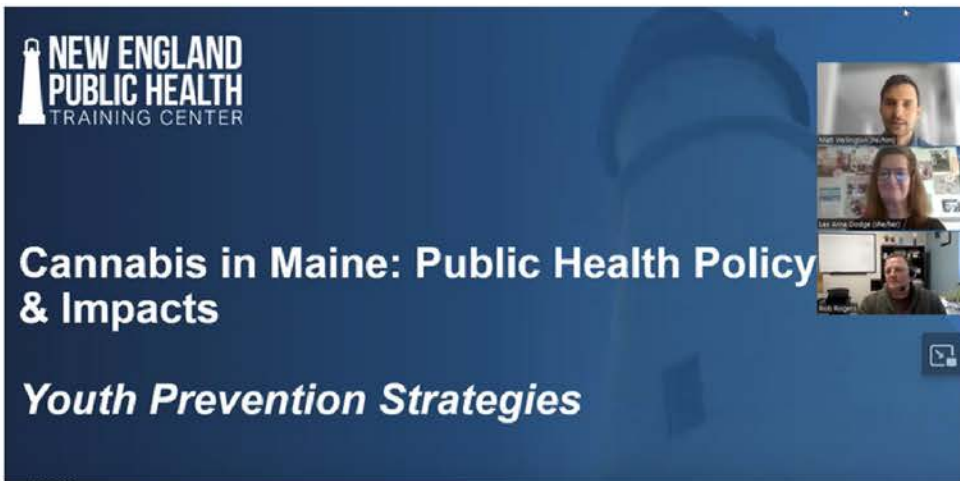
Left : One installment of a 4 part series covering cannabis, public health, and policy in Maine.

In 2023, MPHA continued its monthly webinar series, covering issues like environmental waste solutions, Maine’s Climate Corps, analyzing data on children’s health in Maine, and more. The series, supported by the New England Public Health Training Center, provides public health workers in Maine and across the U.S. (even internationally!) with critical knowledge on public health issues that they can use in their own communities.